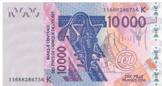
10,000 CFA franc banknote from the BCEAO